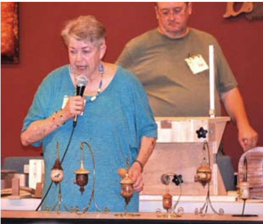
Ornaments by Sandy Cochran