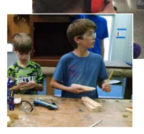
Proud "Car owners" getting ready for race day.

Thanks to ten of our GWG members for giving up a Sunday afternoon and helping a group of Cub Scouts, ages 7-11, with a special project. Each year Cub Scouts and their Dads make a small "Pinewood Derby" car, and have races against each other on a special track. The cars come as kits with a basic block of wood, and we help them cut it out to their own design with our bandsaws and sanders. This project dates back to our old shop, and we have assisted hundreds of young boys, hopefully encouraging them to become future woodworkers.