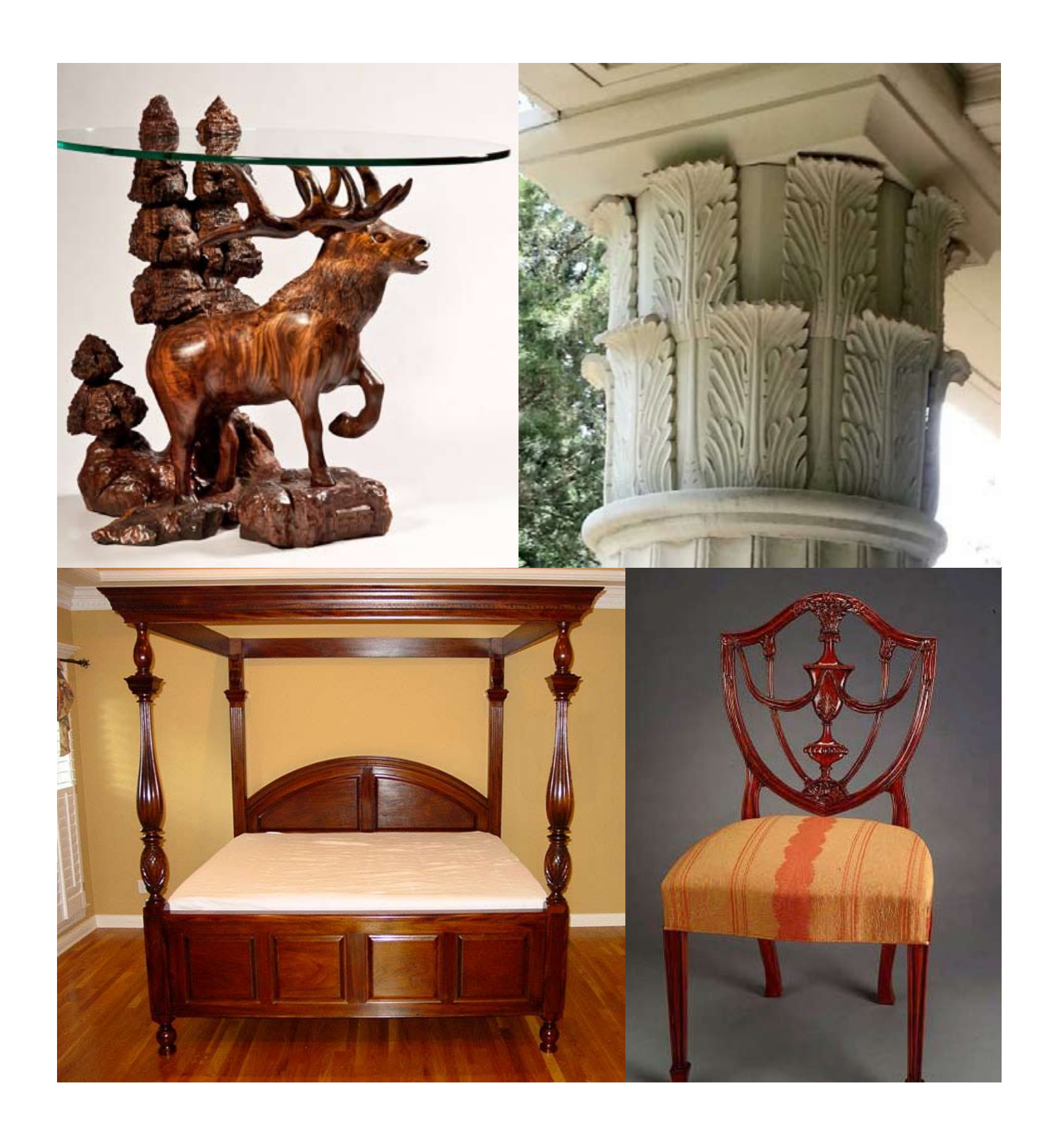
FOR ALF'S GALLERY OF WORK GO TO: