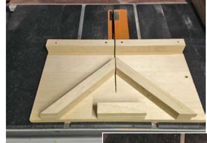
Jig for 45 degree picture frames

Our program chairman Glenn Torbert wants to add some interest and ideas to our "Show & Tell" feature during future meetings. He believes that many of us have favorite jigs or fixtures that we use on a frequent basis to make a certain process go more quickly or smoothly. These may include hand made "one-of-a-kinds" or store bought jigs. They can be for routers, band saws, table saws, drill presses, circular saws, etc. Glenn proposes that we feature jigs or fixtures for a different machine or tool each month at "Show & Tell". We will begin at the August meeting with jigs/ fixtures for the table saw. Please bring your jigs to show, and plan to share a few words on why you like it, how it is used, etc. You are welcome to take a picture or measure them and build your own.