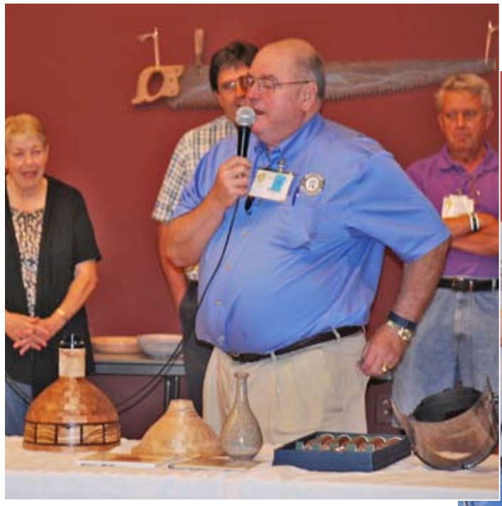
Wells Doty Corian Vessel & segmented vessel