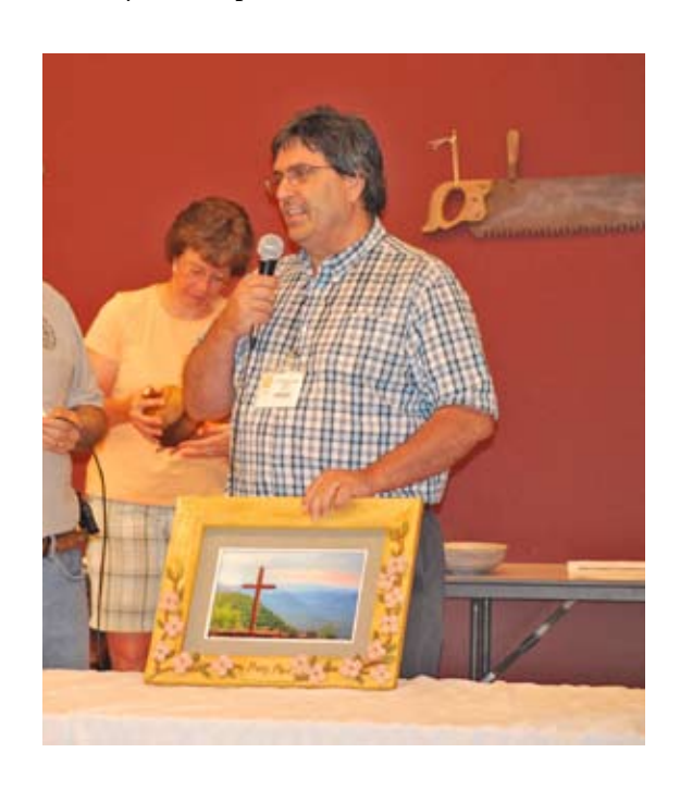
Dave Fisher "Pretty Place" picture frame.