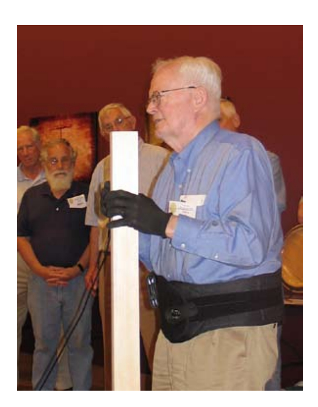
No information available