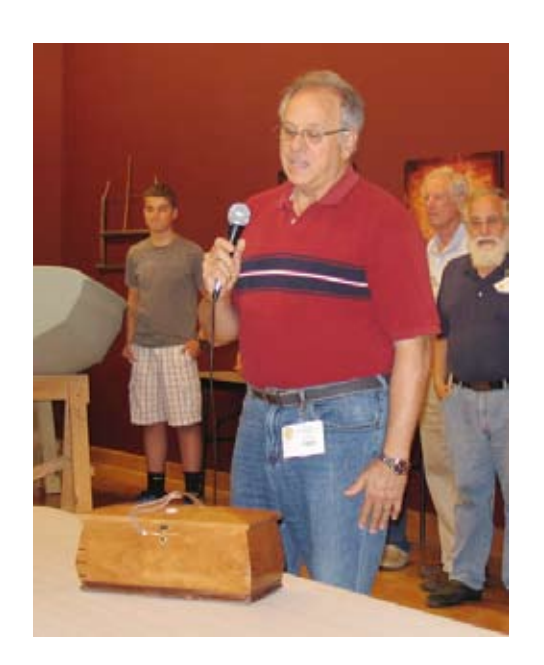
Box for Beads of Courage