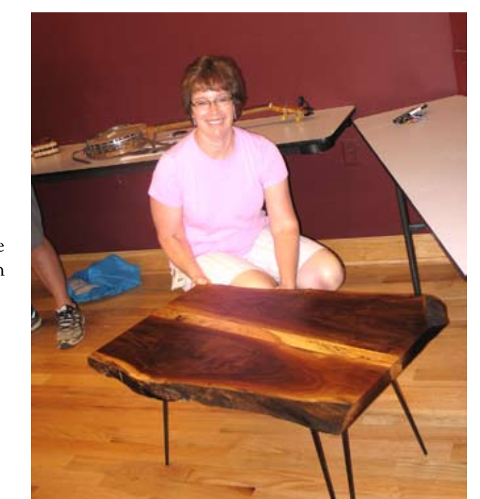
Coffee Table by Karen Sheldon