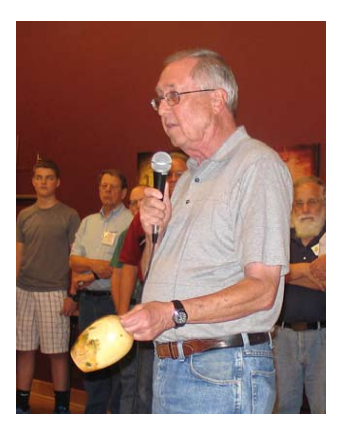
Painted Hollow Form by Tom Berg