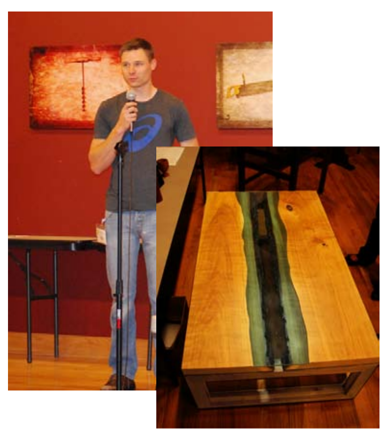
Coffee Table by Tobias Martin