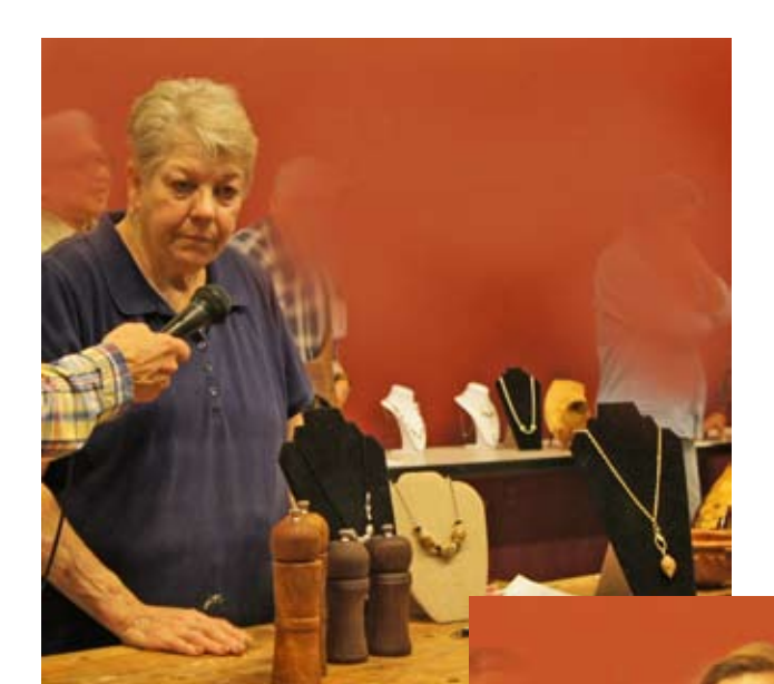
Pepper grinders and jewlery by Sandy Cochran