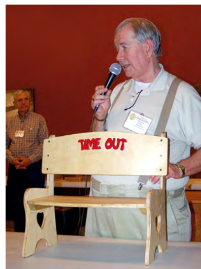
Time Out Bench by Charles Kindig