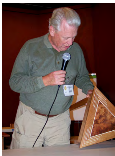
Triangle Table by Dick Best