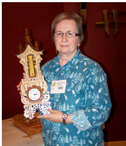
Gingerbread Clock by Michele Grandonico

For more photos and details visit our website www.greenvillewoodworkers.com