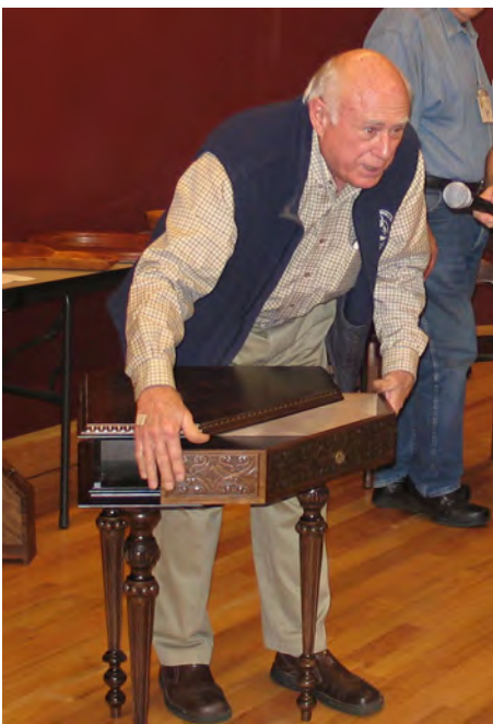
Carved table by Bobby Hartness