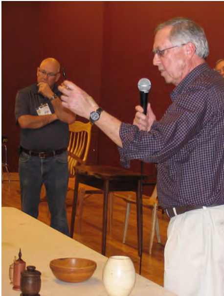
Bowl, Hollow Form & 4 Lidded Boxes by Tom Berg